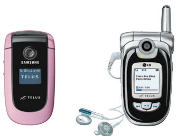
Samsung A840 Camera phone