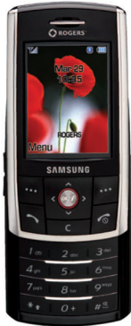
Samsung d807 $149*