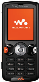
SonyEricsson W810 $149*