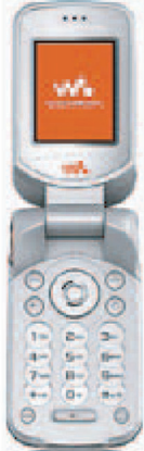
SonyEricsson W300 $49*