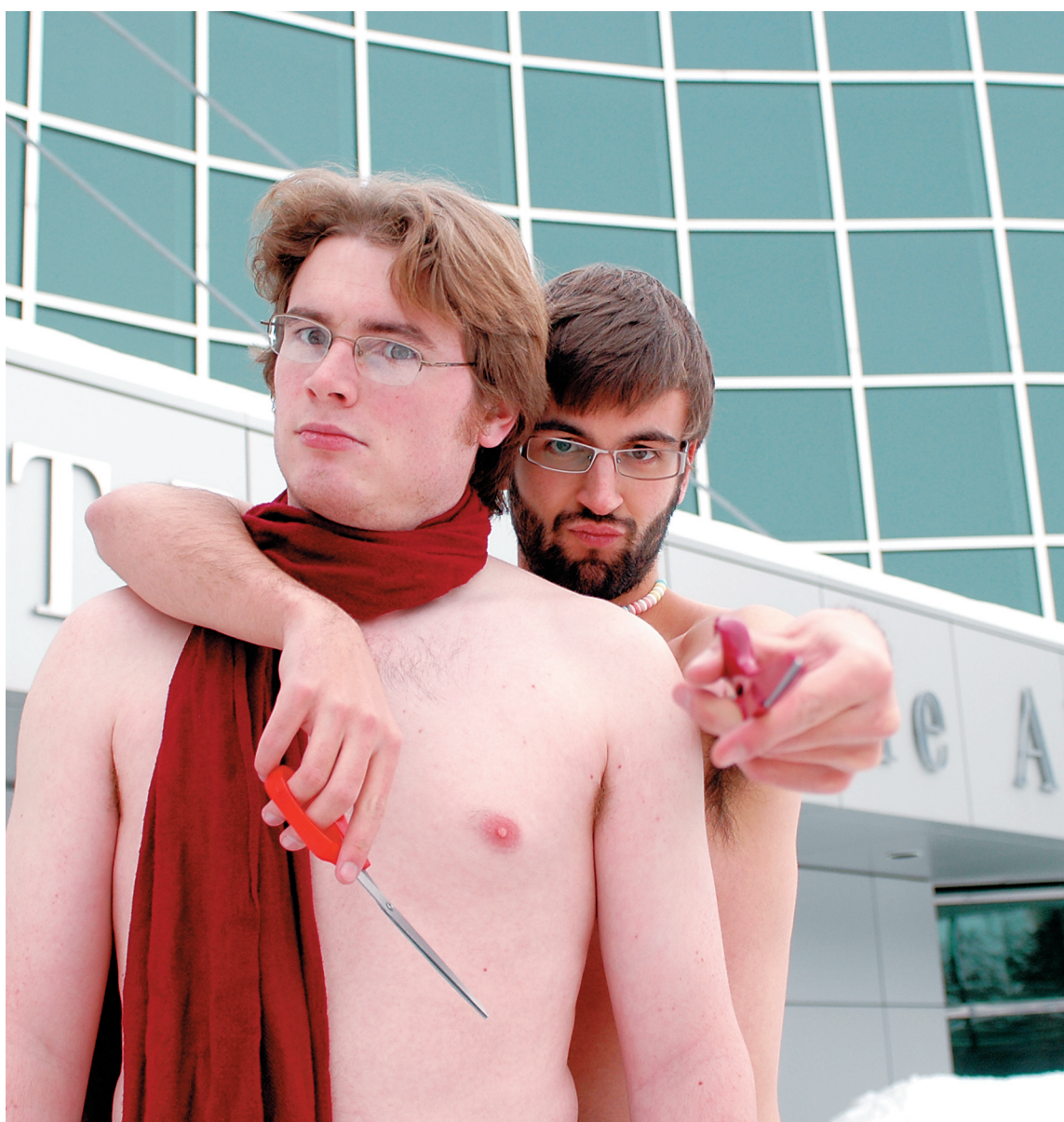
YIN YANG POO

CUTS LIKE A KNIFE But do those scissors cut as well as that nipple would? Holy fiddlesticks, Batman! JIZZZZZZZZZZ!