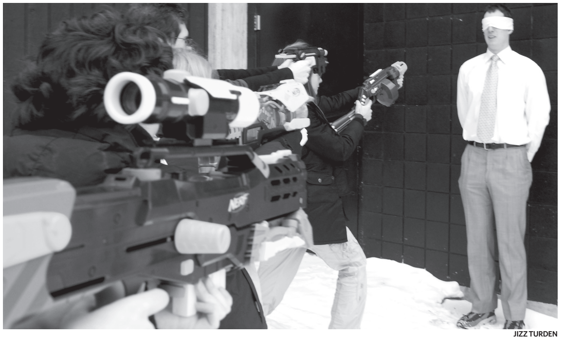
GOING OUT WITH STYLE In all seriousness, the EiC wasn't executed. He was simply fired and burned horribly with acid.

As of press time the Dime Store Conspiracy had collected almost nine dollars in change, only $4.80 less than the amount needed to refund the extra dime charged to every member of the group.