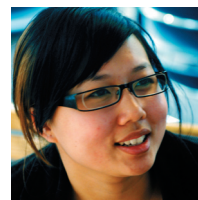
Lam Tran Pharmacy I

I think it should offer one about the sexual habits of insects and invertebrates. I think that it is such a fascinating world out there, and there are so many insects and so many invertebrates, and we don't know very much about them. I am sure they have fantastic sexual lifestyles.