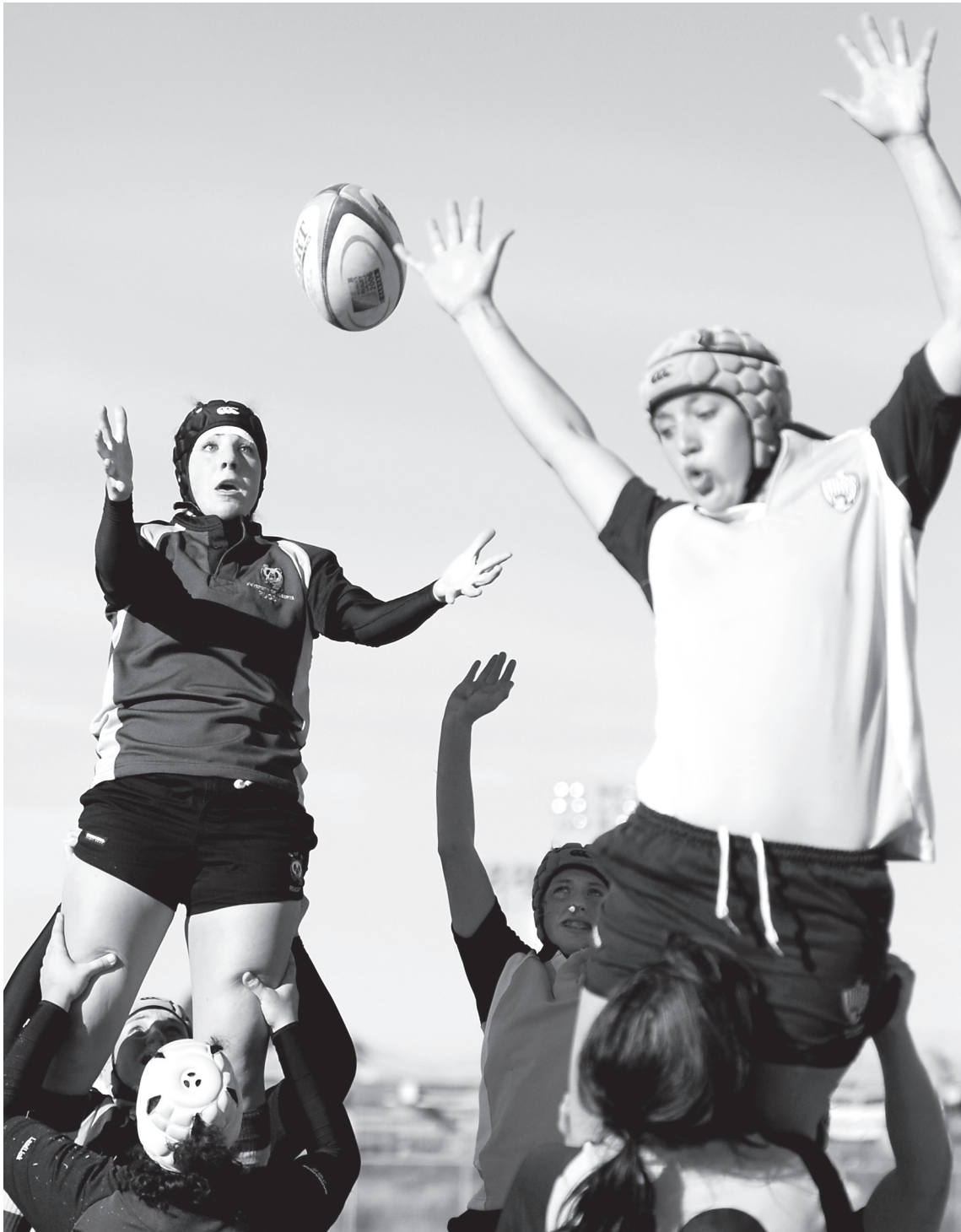
I'M OPEN, I'M OPEN! The Pandas (dark) beat UVic, but lost Canada West gold to Lethbridge last weekend in Victoria.