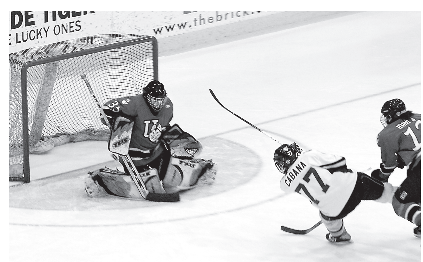
WHO NEEDS TWO LEGS? The Pandas have been up and down lately, but they hope to tip the balance with two wins this weekend at home against UBC.