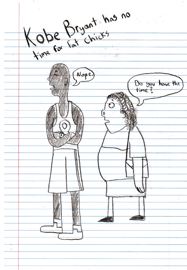
KOBE BRYANT LIVING & LOVING by Pierced Colon