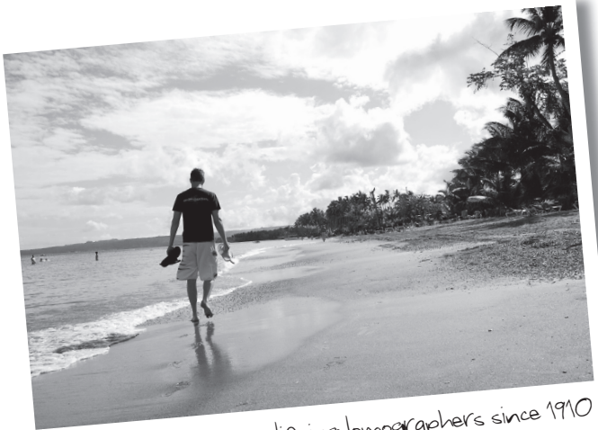
The Gateway - Disqualifying lomographers since 1910

The 1 st annual Gateway photo contest! WE'VE SHOWN YOU OURS, NOW SHOW US YOURS!